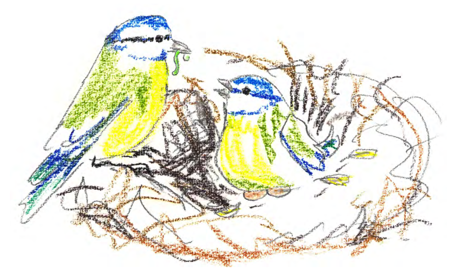
Mummy blue-tit sits on her eggs. Sometimes daddy blue-tit brings her some food.