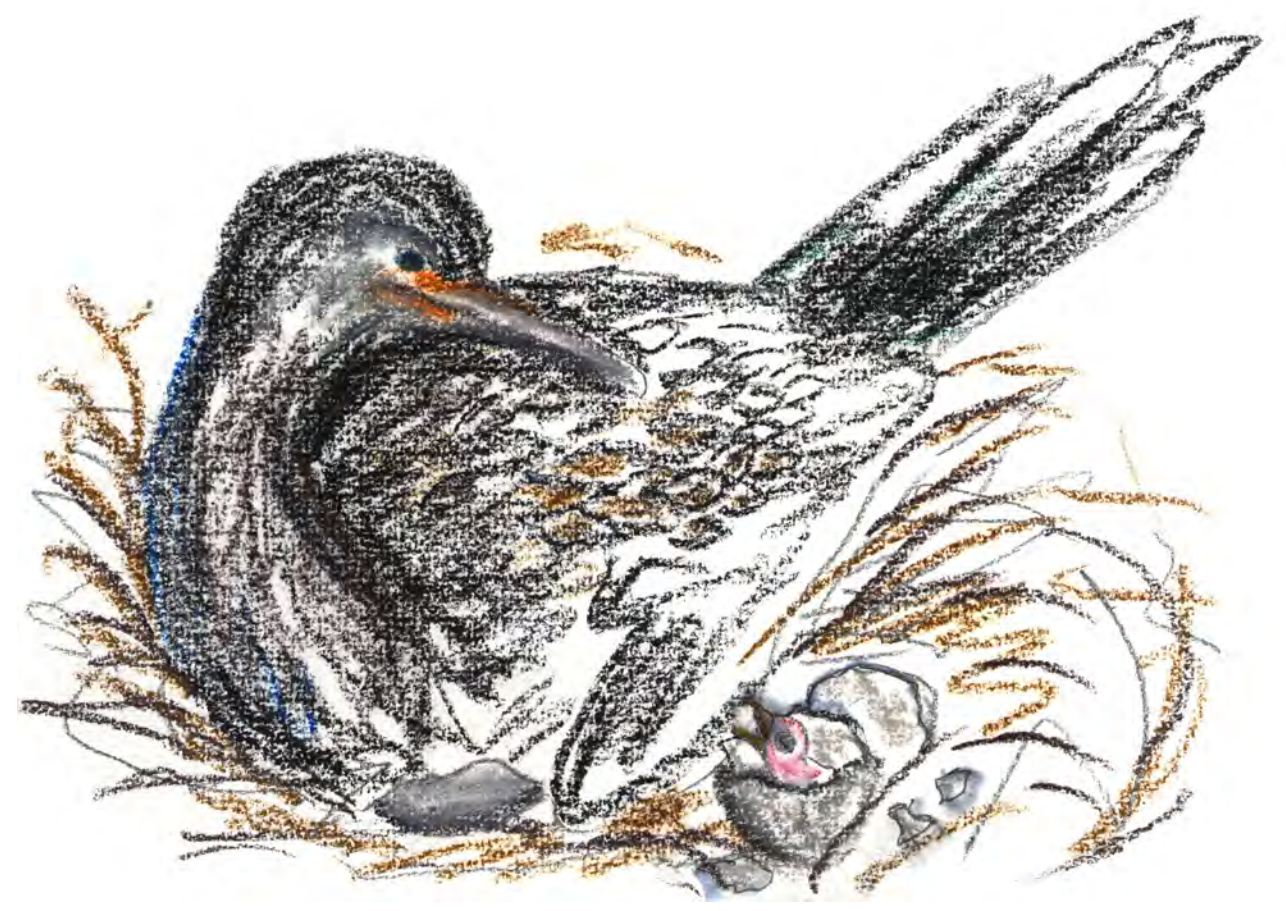
Once the eggs are ready, they start to hatch. The baby birds break the shell with their beaks.