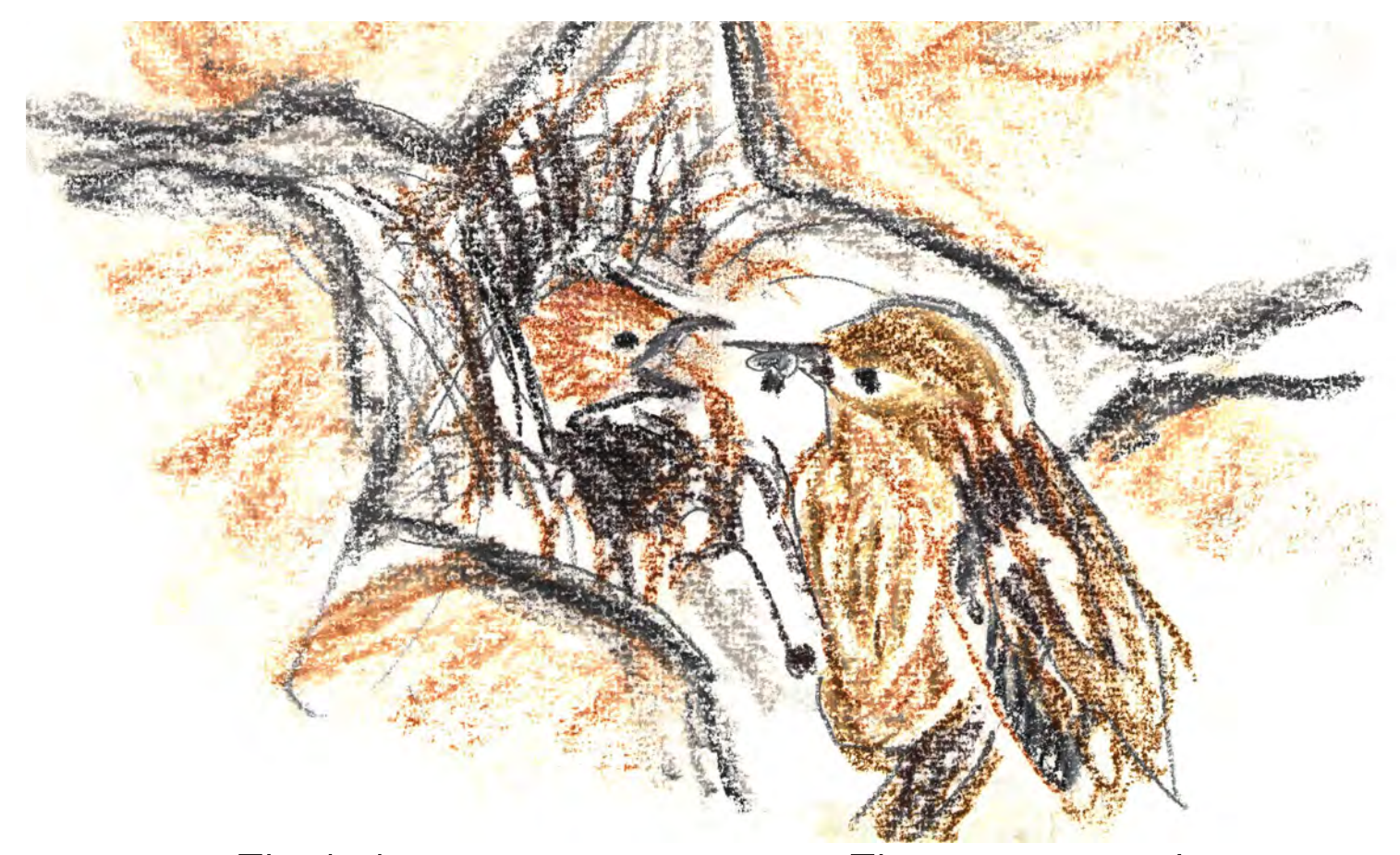
The baby wrens are very tiny. The mummy and daddy wren have to bring them insects to eat.