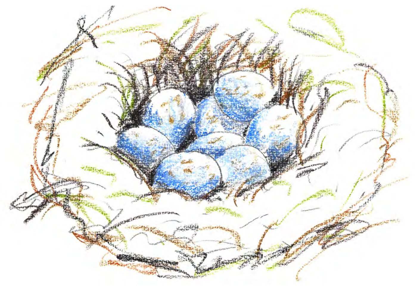
Once the nest is finished, mummy blue-tit lays her eggs.