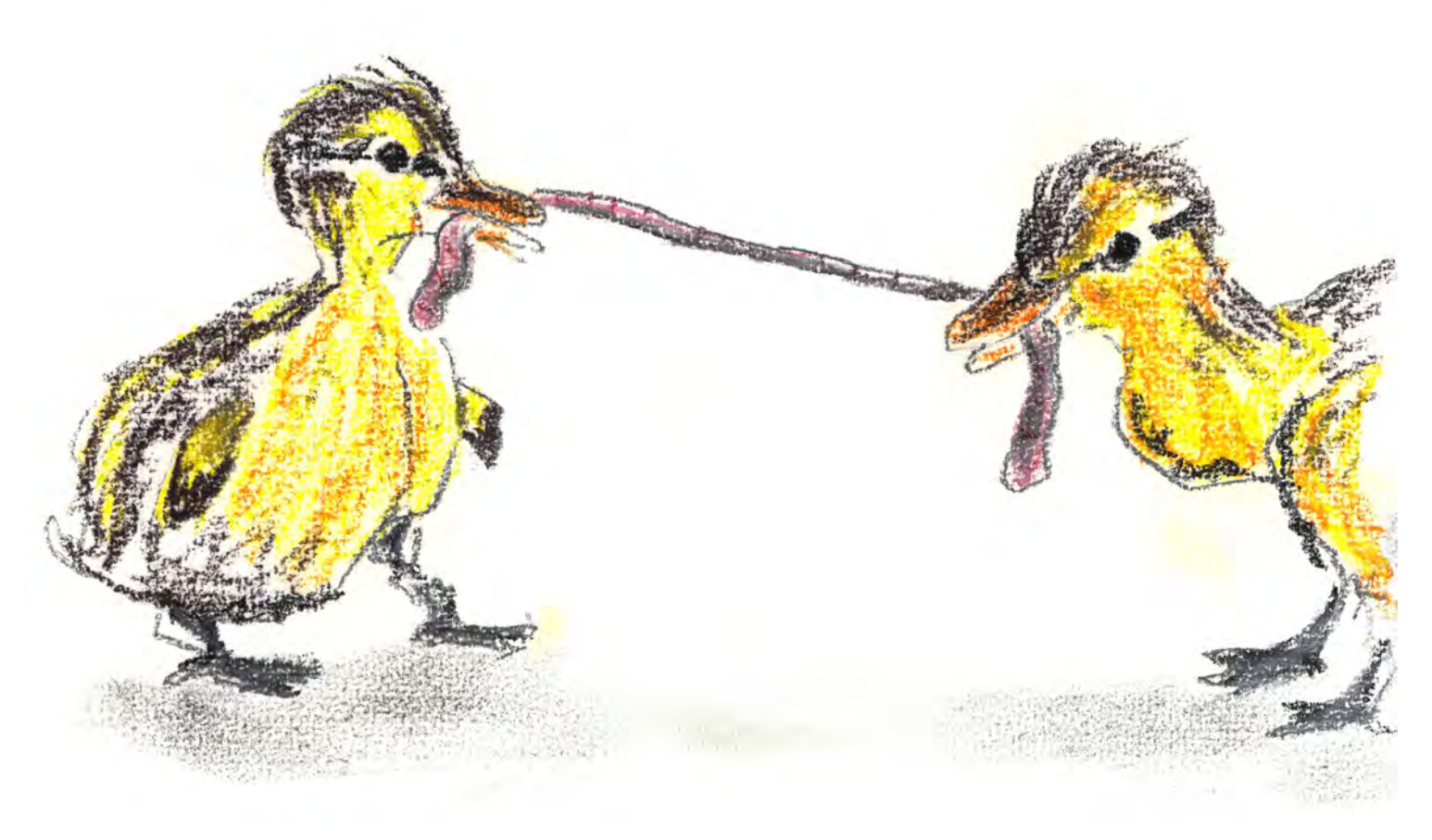
Ducklings also like to eat worms. Yuk!