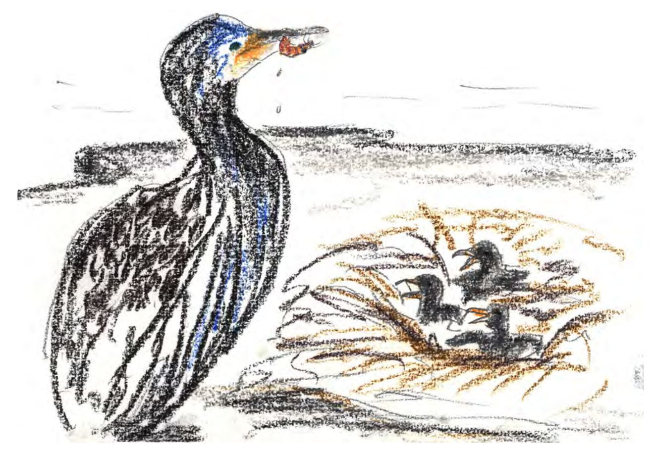
Mummy and daddy shag eat little shell fish and small sea worms. Then they feed their babies.