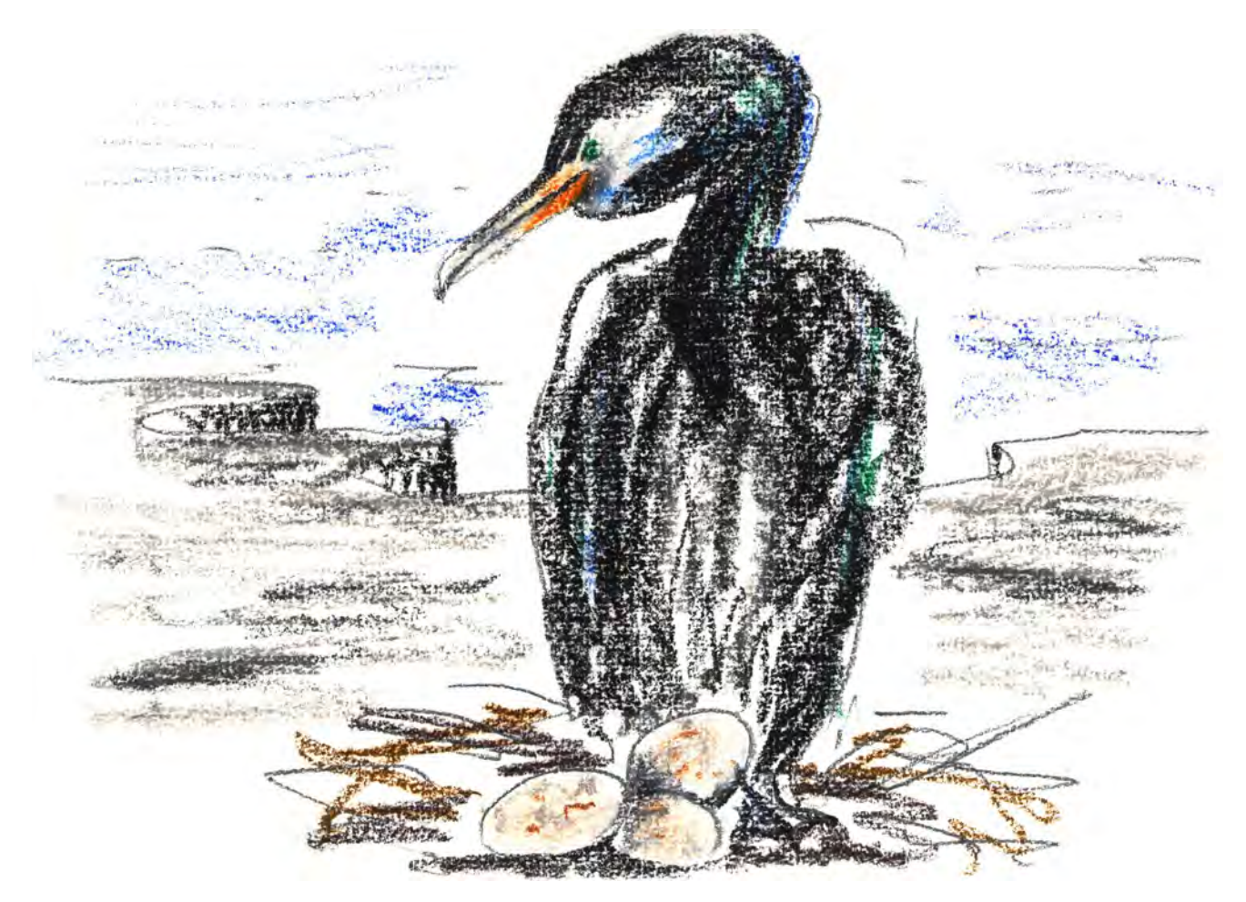
The shag's eggs are big.