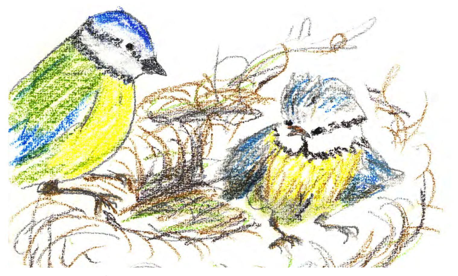
Once the babies get bigger they have to learn to fly. This is not easy!