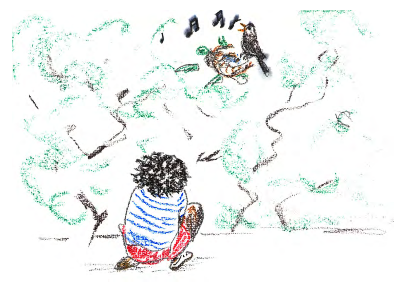
"Thank you!" sings the mummy blackbird.