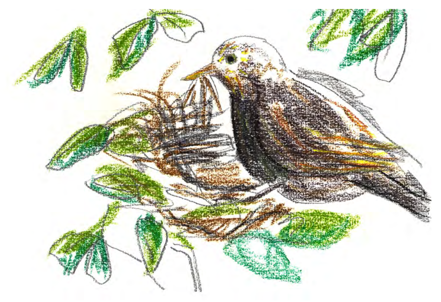
In spring, lots of other birds are making nests too.