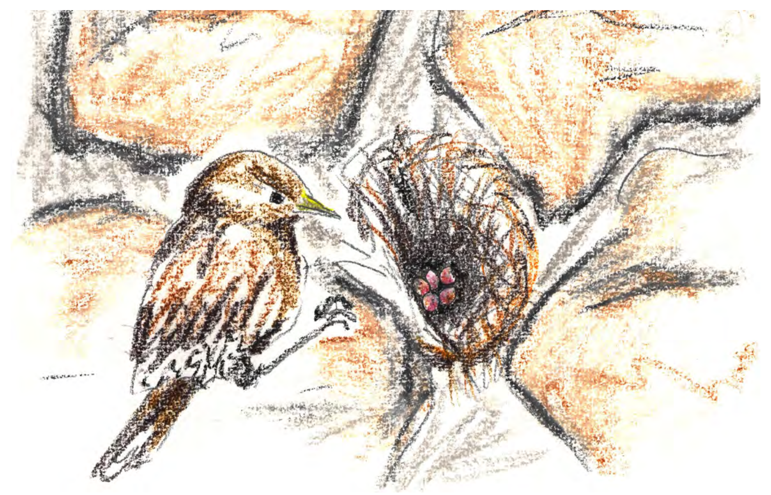
The wren's eggs are tiny!