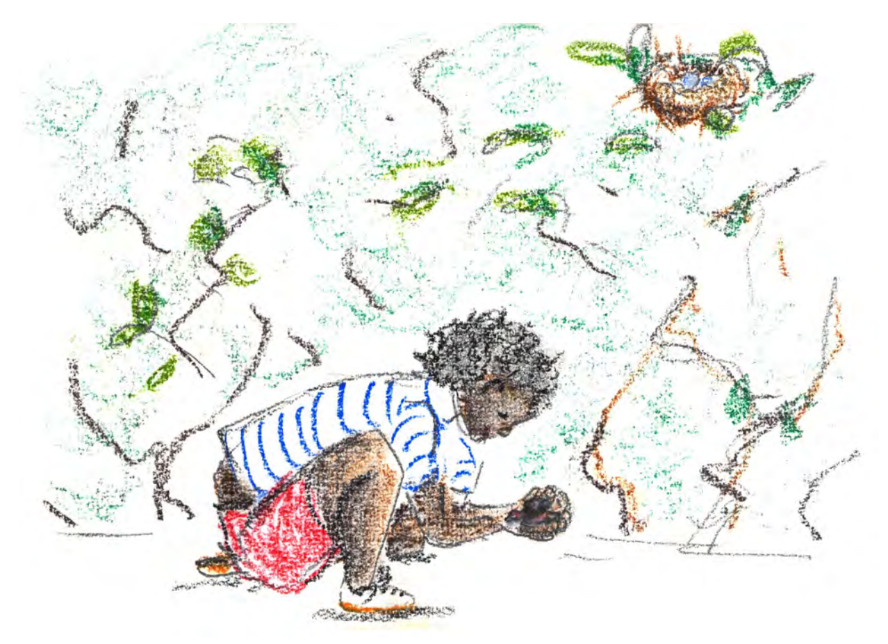
Sometimes baby birds fall out of the nest. They need to be saved.