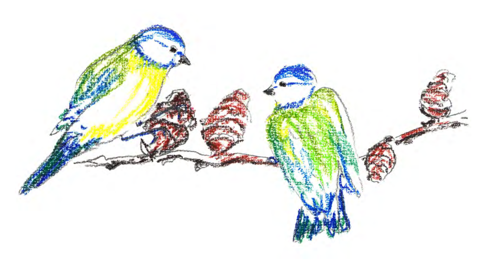
Here are mummy and daddy blue-tit.