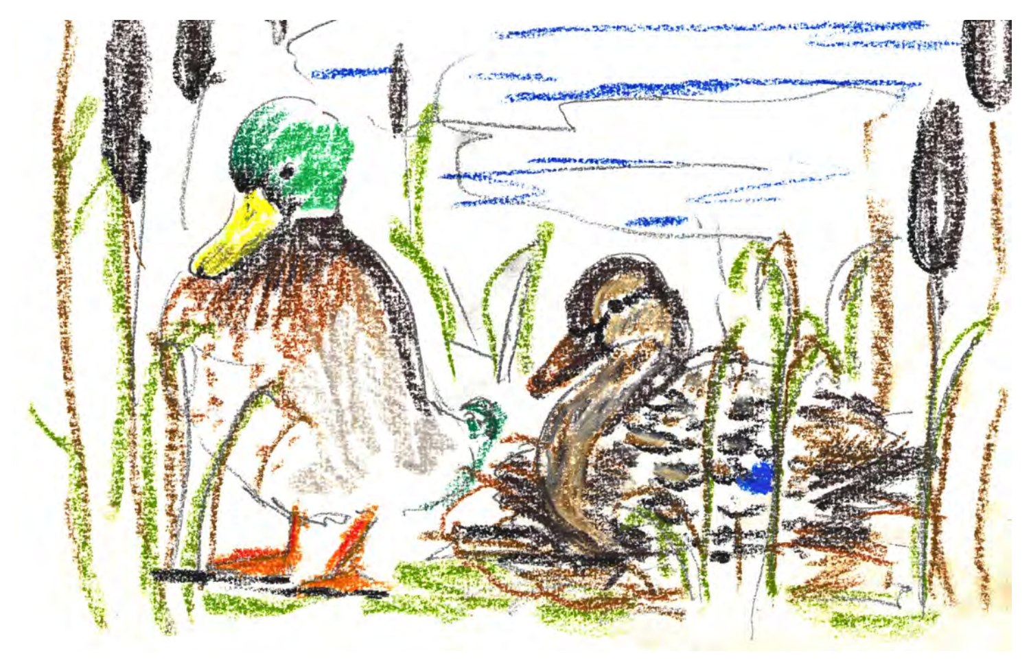
Ducks nest near the river or pond where they live.