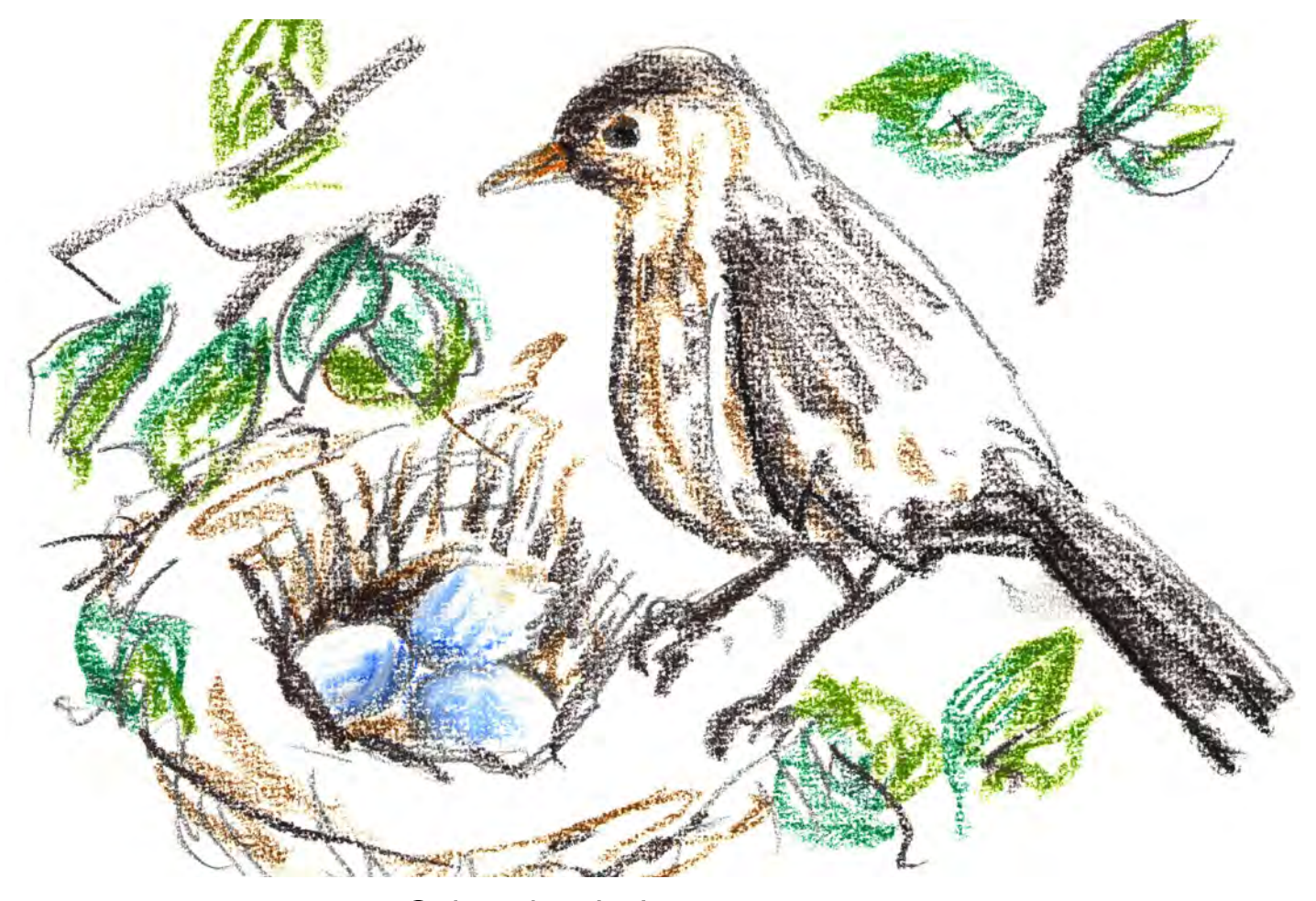
Other birds lay eggs too.