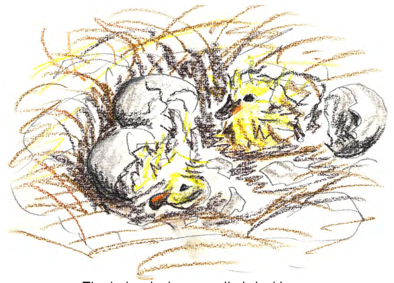
The baby ducks are called ducklings.