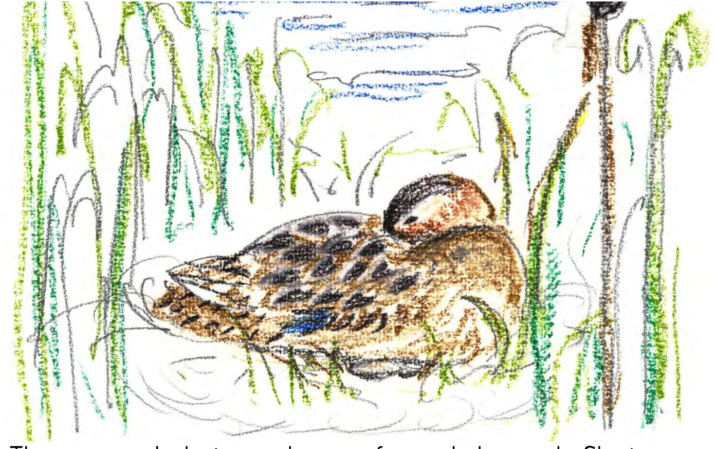
The mummy duck sits on the eggs for a whole month. She is not able to eat much at all because she cannot leave her eggs.