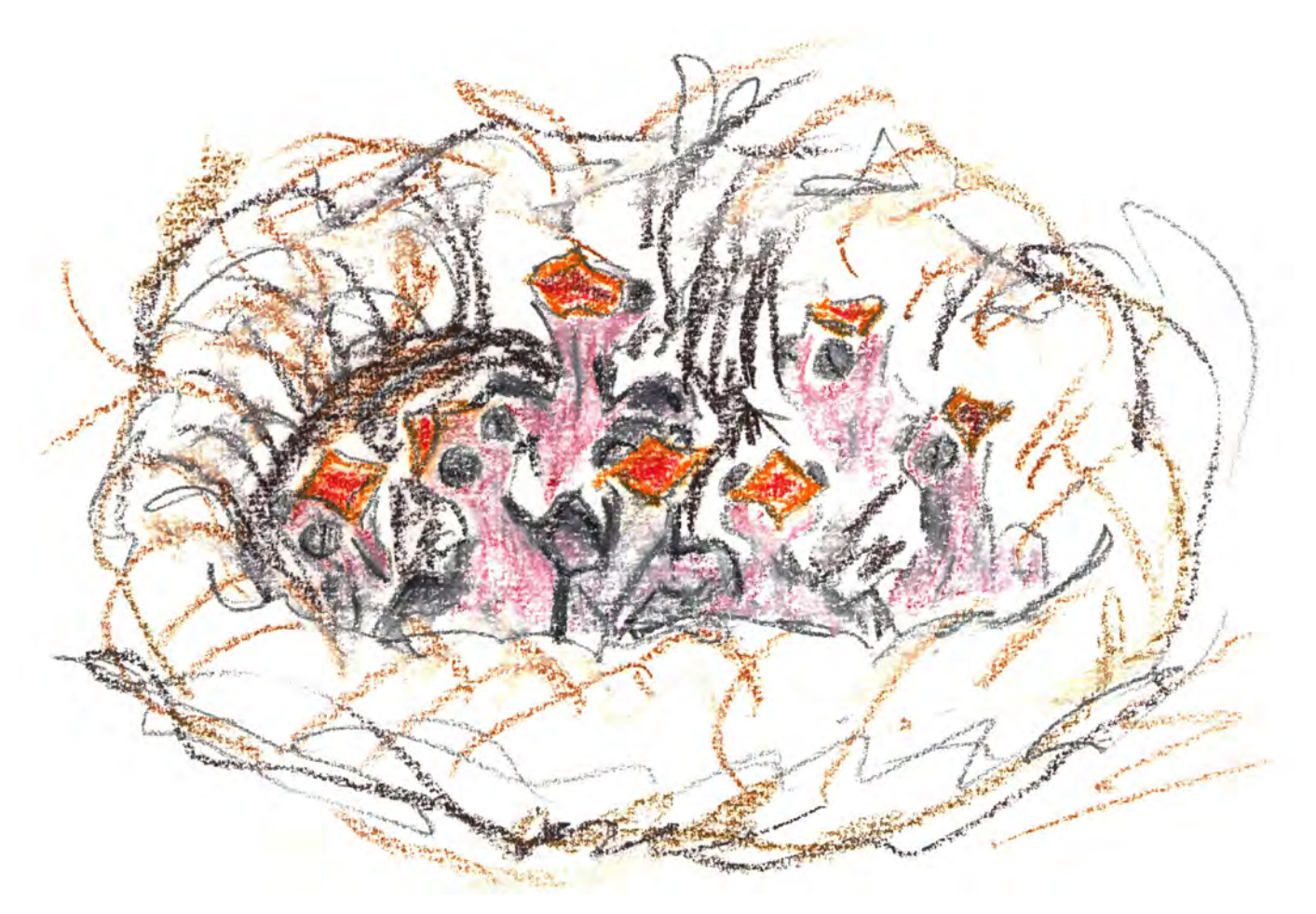
There are a lot of baby blue-tits.