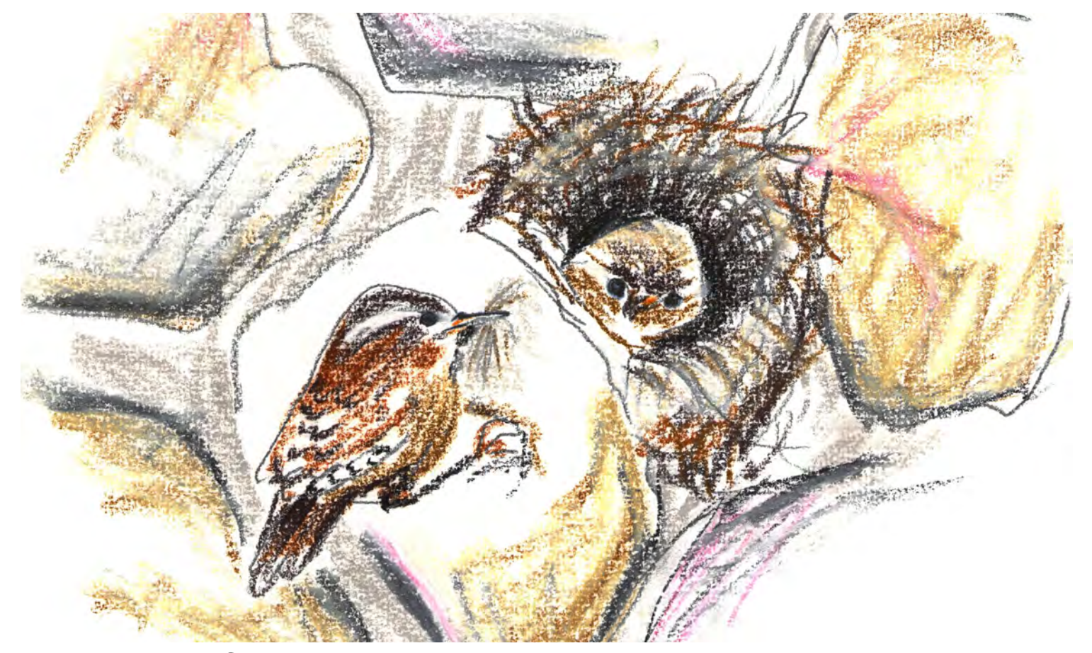
Some are tiny and need small, safe places. These wrens make nests in holes in walls.