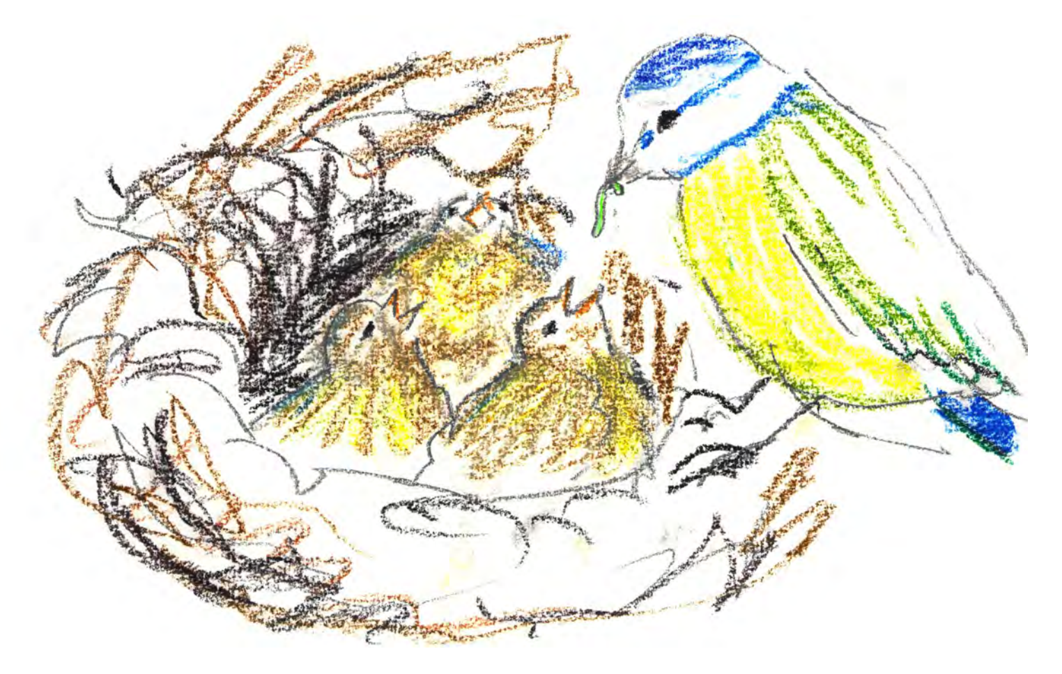
Baby blue-tits like caterpillars.