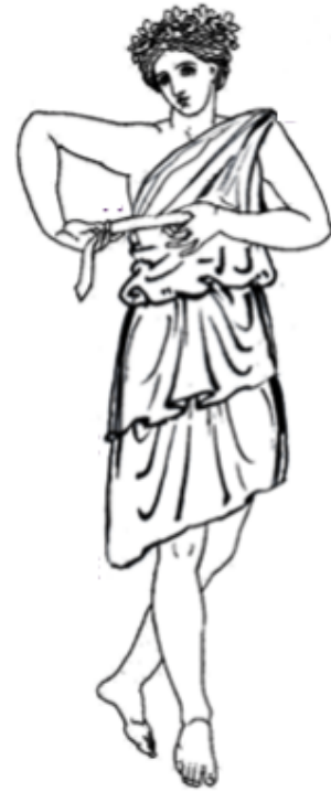
Step 4: Wrap around the body and fasten on the shoulder. Secure with a cord around the waist.