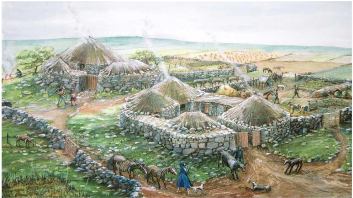
A typical Celtic village - What can you see?

A famous question: What did the Romans do for us?