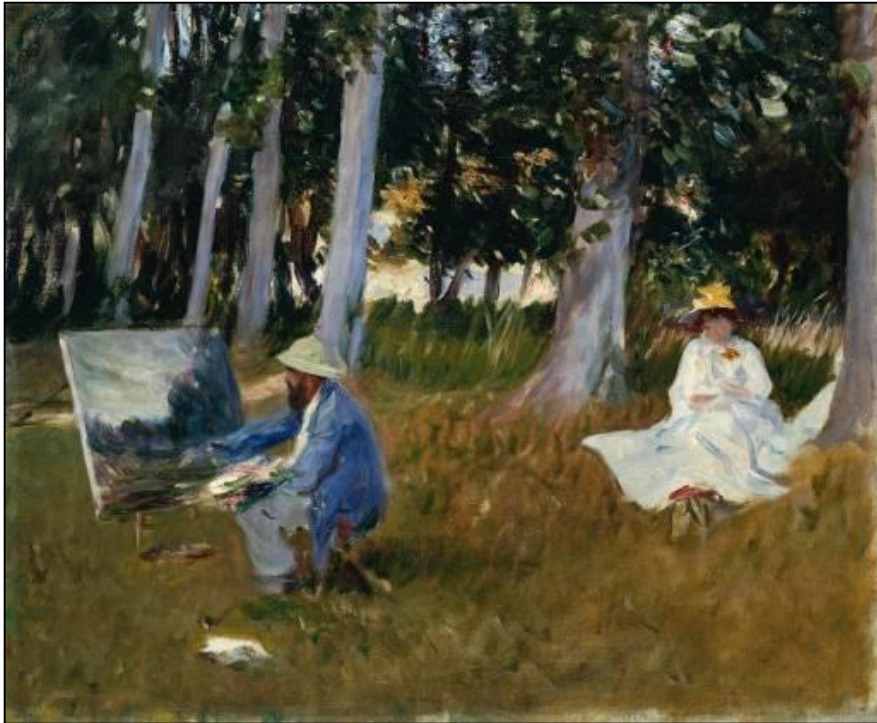
A painting of Monet by John Singer Sargent

When he was 18 Claude decided to go to art school in Paris against his father’s wishes. He made friends with other artists and together they loved to paint outside.